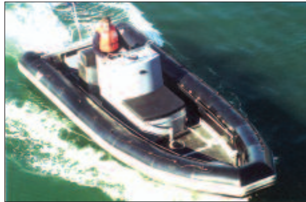
Upper-WILLARD 7m R.I.B. with Dive Door