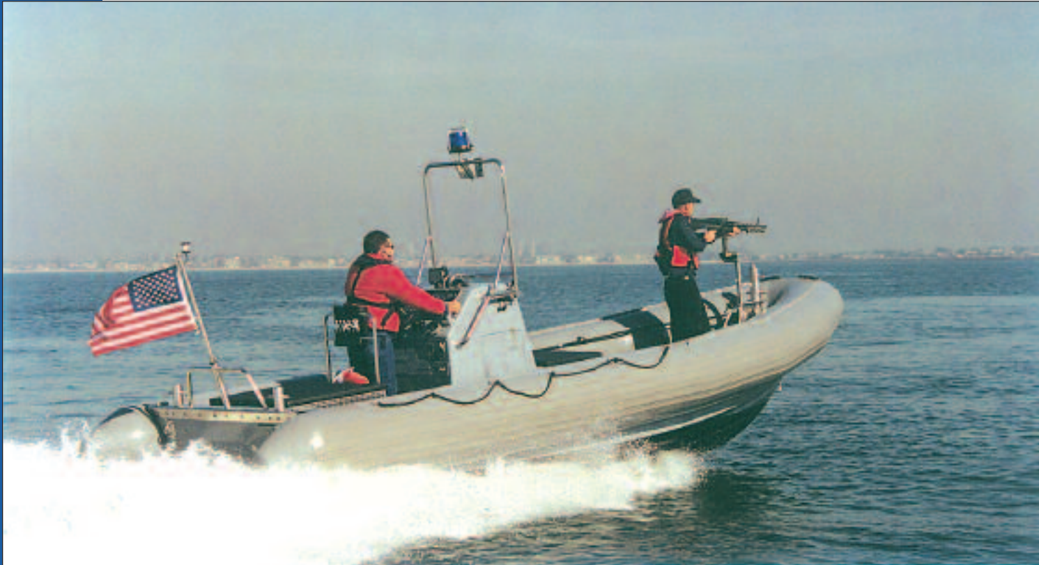
WILLARD 7m Navy Standard R.I.B. with Force Protection Option

Willard Marine, Inc. SEA FORCE Rigid Inflatable Boats (R.I.B.s) are designed, tested and manufactured by Willard Marine in Anaheim California, U.S.A. Willard Marine has been in business for over 45 years, and is known for producing boats of the highest quality as demanded by its principally commercial and military customers.