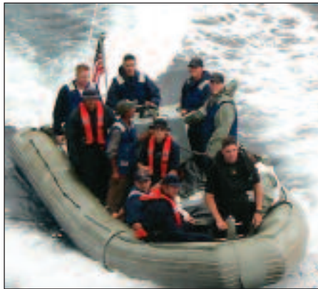
WILLARD 7m Navy Standard R.I.B.