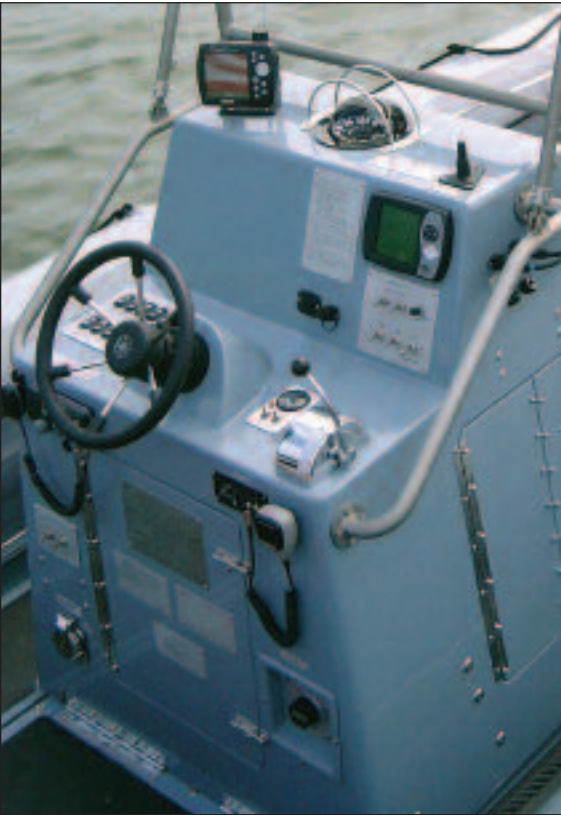
WILLARD 7m Navy Standard R.I.B. Console