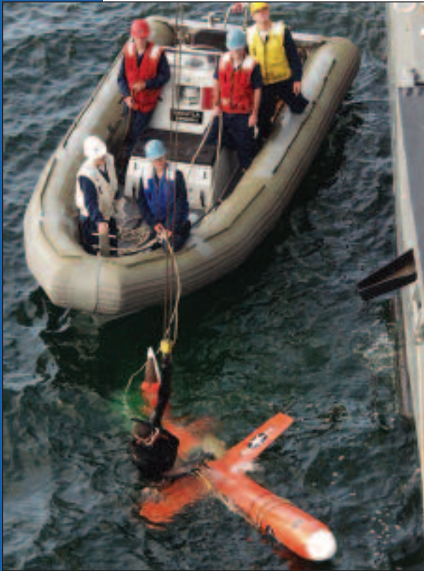
WILLARD 7m Navy Standard R.I.B.