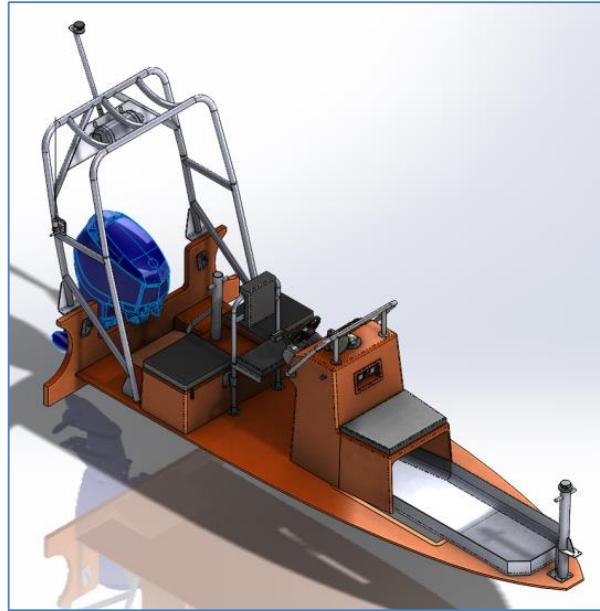
IN DEVELOPMENT - 540 SOLAS Rescue Boat – EXPECTED SECOND QUARTER 2015